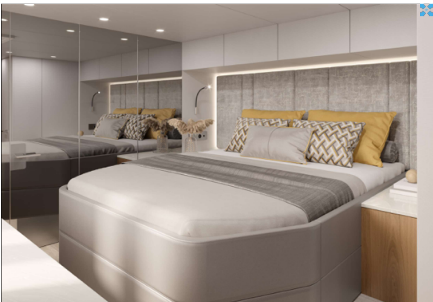
Sunreef 50 ZARA Master Cabin

Sunreef 50 ZARA comfortably accommodates 8 in 4 spacious elegant guest cabins all ensuite, with separate cabins for crew.