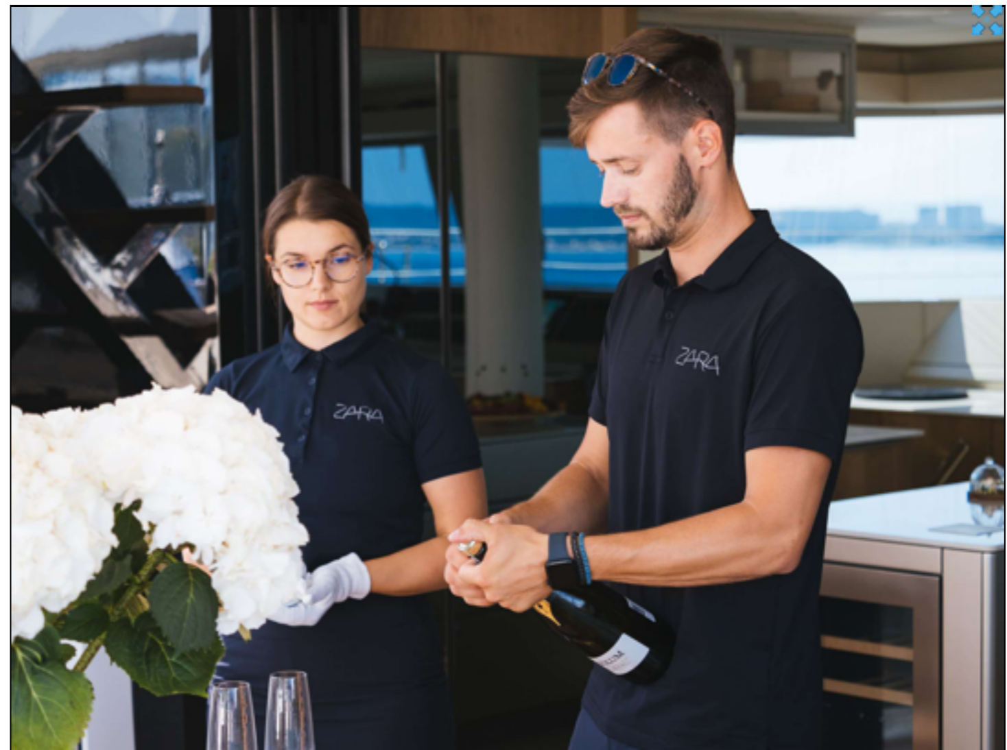
Sunreef 50 ZARA cockpit