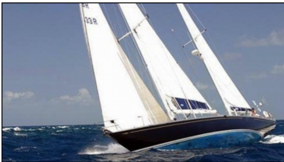
SY Margaux sailing 3