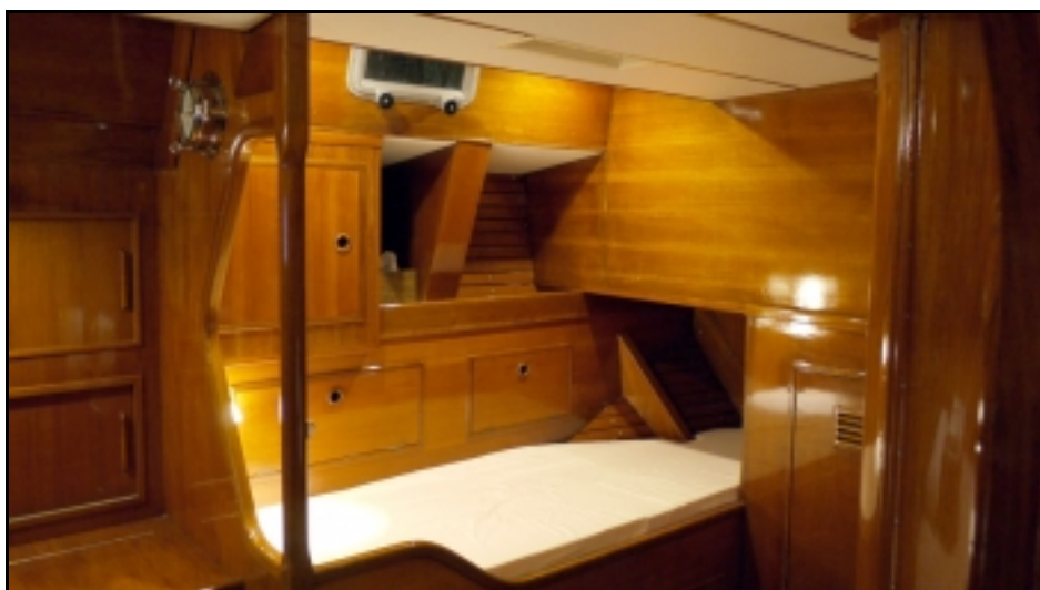
SY Margaux master cabin stb