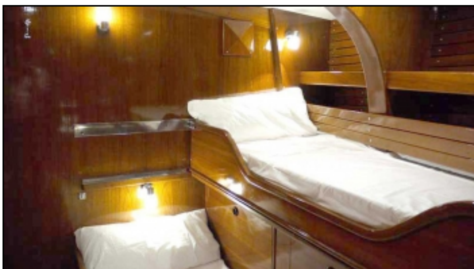
SY Margaux cabins fwd