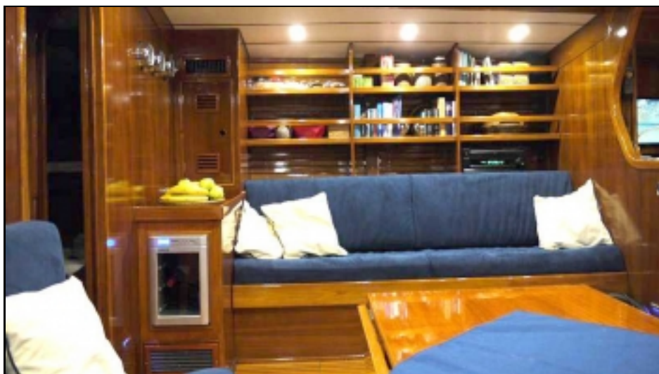
SY Margaux salon2