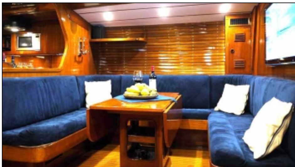
SY Margaux salon