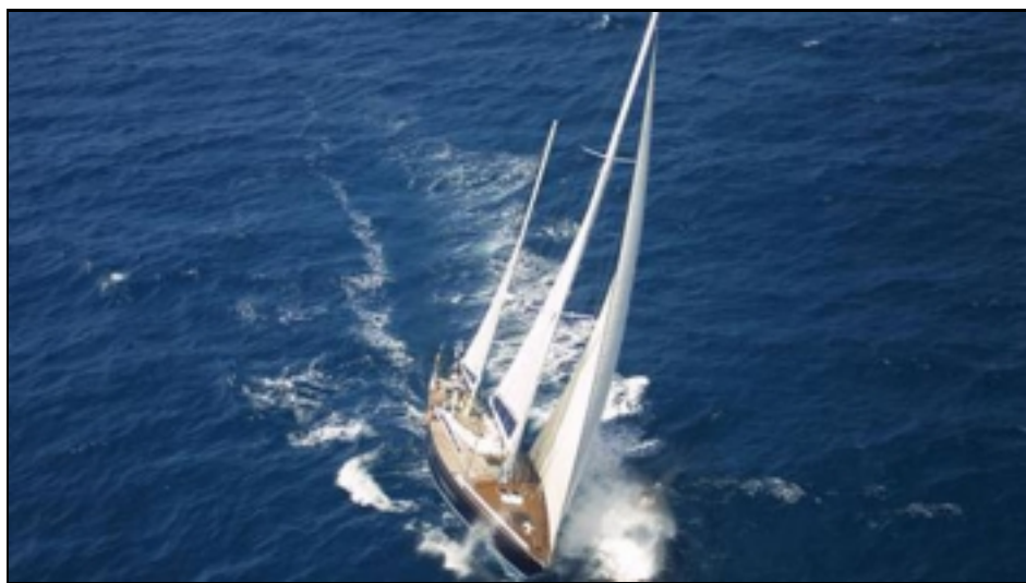
SY Margaux sailing 2